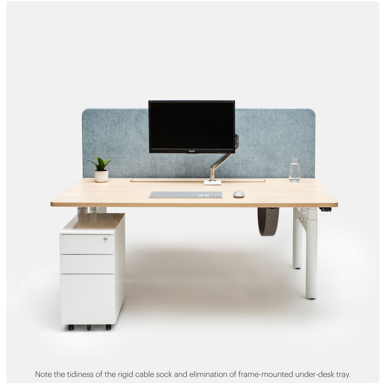
Note the tidiness of the rigid cable sock and elimination of frame-mounted under-desk tray.