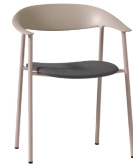
Armchair with upholstered seat