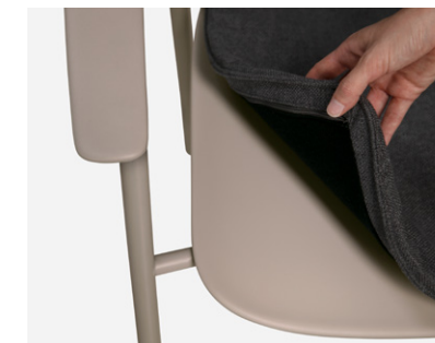
Removable seat cushion