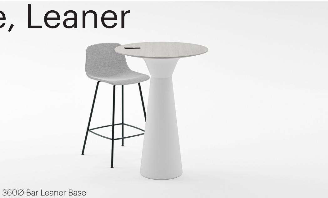
360° Bar Leaner Base