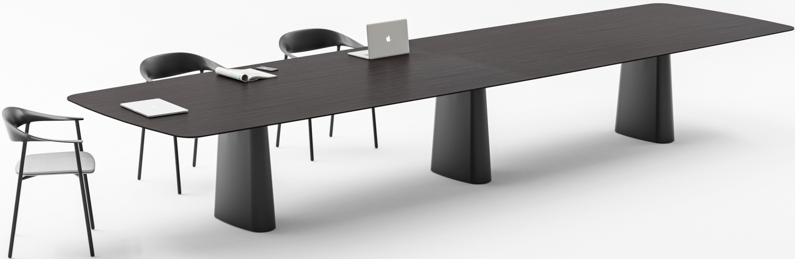
Oval 3x Bases